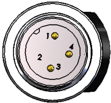
DETAIL B SCALE 3 : 1