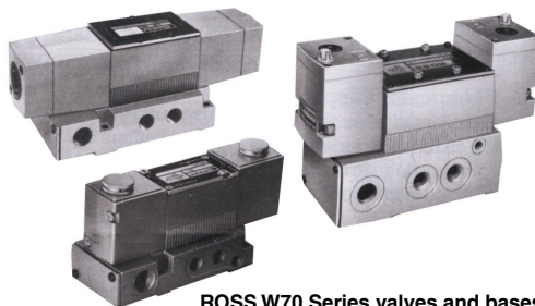
ROSS W70 Series valves and bases (bases sold separately).

With care in its installation and maintenance you can expect it to have a long and economical service life. So before you go any further, please take a few minutes to look over the information in this document. Then, save it for future reference and for the useful service information it contains.