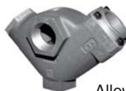
QUICK EXHAUST VALVES

Has two inlets and one outlet. The outlet can be operated by either of two inlets. The first inlet to be pressurized is connected to the outlet, and the second inlet is then closed.