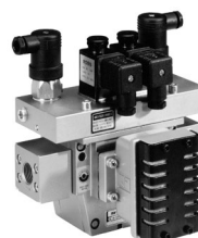
Valve Basic Size 4

It is a SERPAR® Crossflow double valve designed for use with a suitable external monitor . The external monitor must ensure that the operation of the double valve is inhibited should there be a malfunction in the system impacting proper valve functions. With care in its installation and maintenance, you can expect your valve to have a long and reliable service life. Before you go any further, please take a few minutes to look over the information in this folder, and save it for future reference.