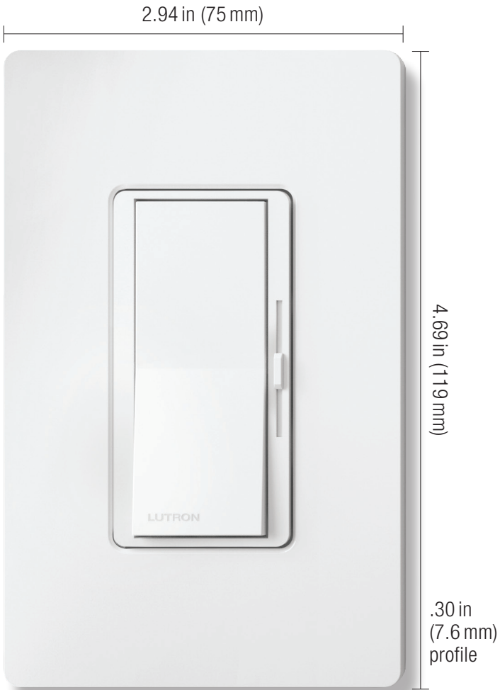
Shown actual size: Diva preset dimmer and 1-gang Claro wallplate in White (WH).