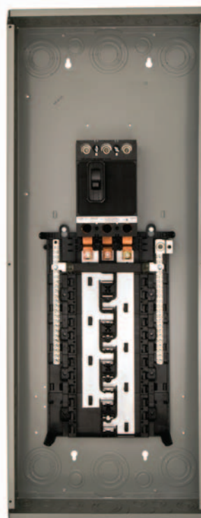
ES Series 3-phase