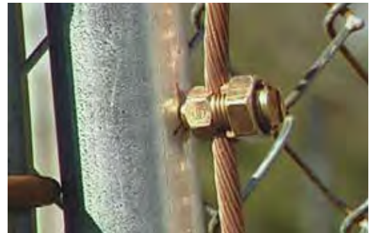
K2C - 1 to 2 wires